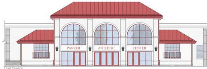
Montclair State University - Panzer Athletic Center January, 2008

Reopened in fall 2009 following extensive renovation, Panzer Gymnasium (approximately 70,000 gross square feet) received upgrades to the competition gym, a new building entrance (façade) on College Avenue, interior upgrades, a new electrical system, and extensive upgrades to the present HVAC system.